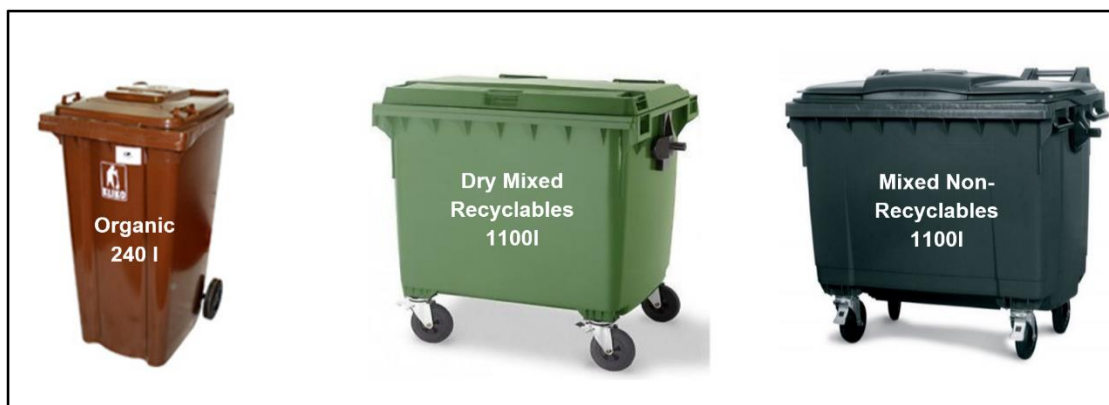
Figure 5.1 Typical waste receptacles of varying size (240L and 1100L)

The types of bins used will vary in size, design and colour dependent on the appointed waste contractor. However, examples of typical receptacles to be provided in the WSA are shown in Figure 5.1. All waste receptacles used will comply with the IS EN 840 2012 standard for performance requirements of mobile waste containers, where appropriate.